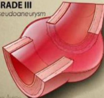
GRADE III Pseudoaneurysm